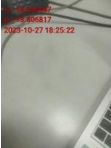
Area Or Locality Photo (1)